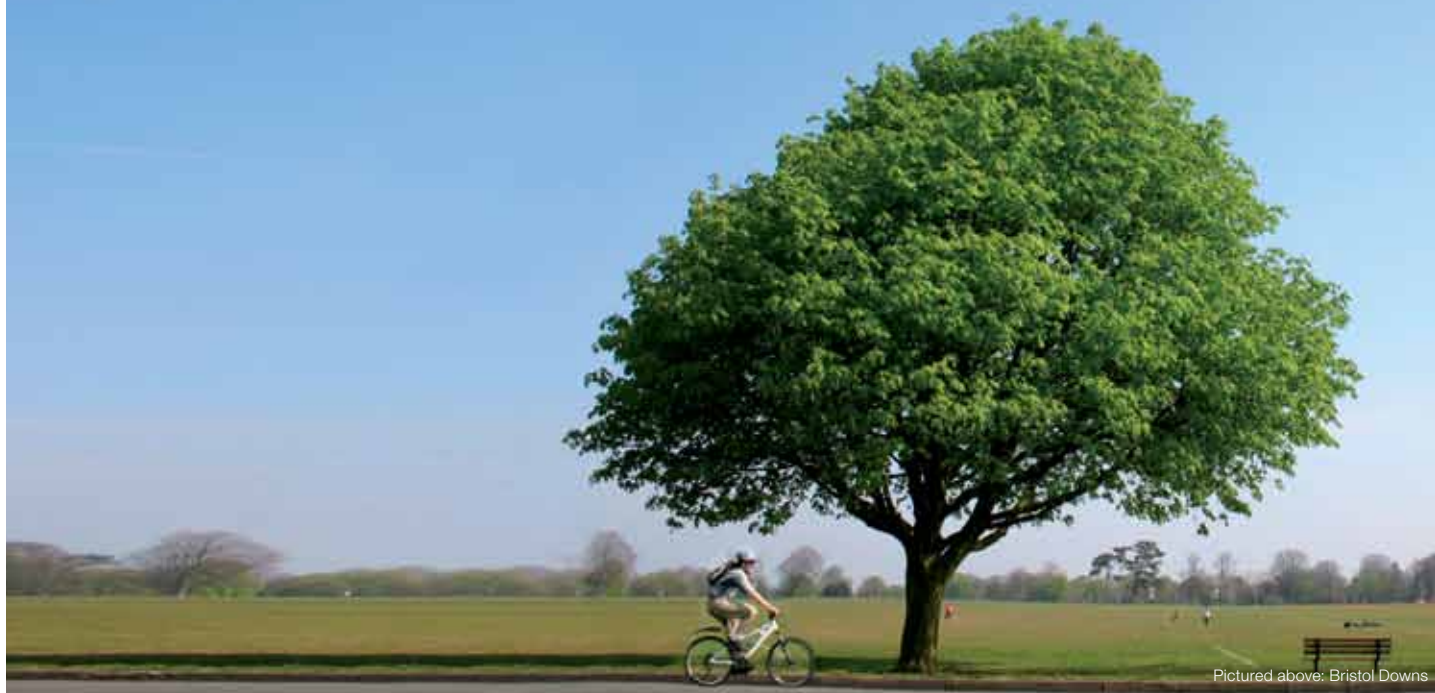
Pictured above: Bristol Downs