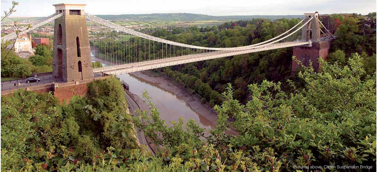
Pictured above: Clifton Suspension Bridge