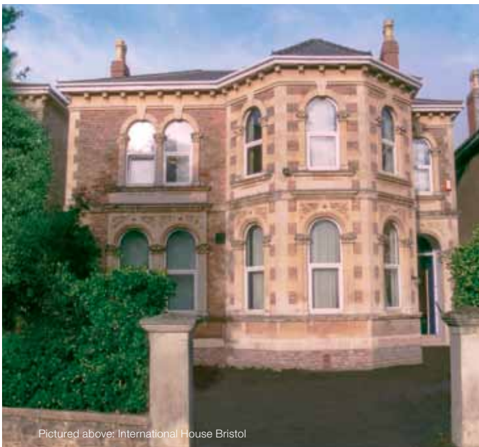
Pictured above: International House Bristol

“I have made so many friends from all over the world. It's a great school and I was very happy to be a student here.”